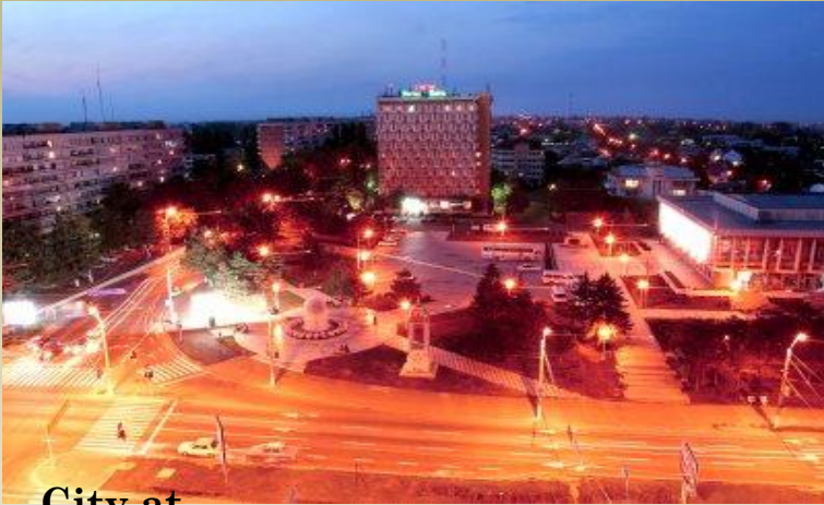
City at night