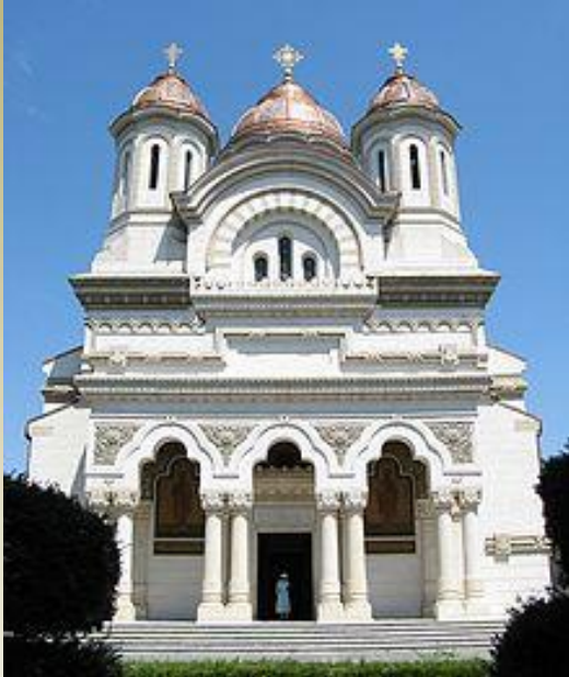
The Romanian Orthodox Cathedral