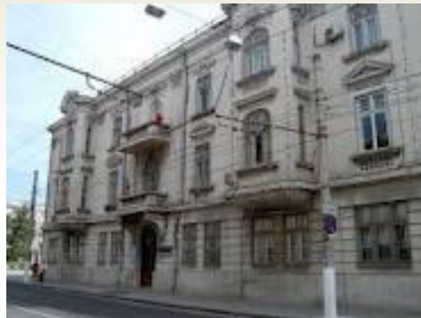
Galați City Hall