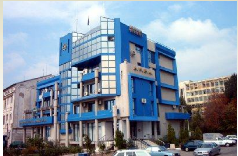
River Administration of the Lower Danube Galati