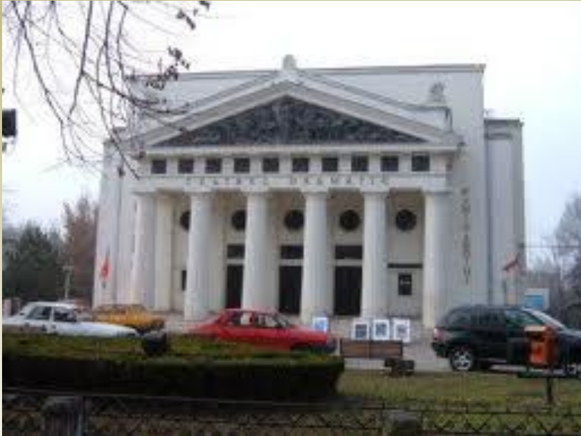
“Fani Tardini” Drama Theatre