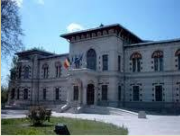
Visual Arts Museum