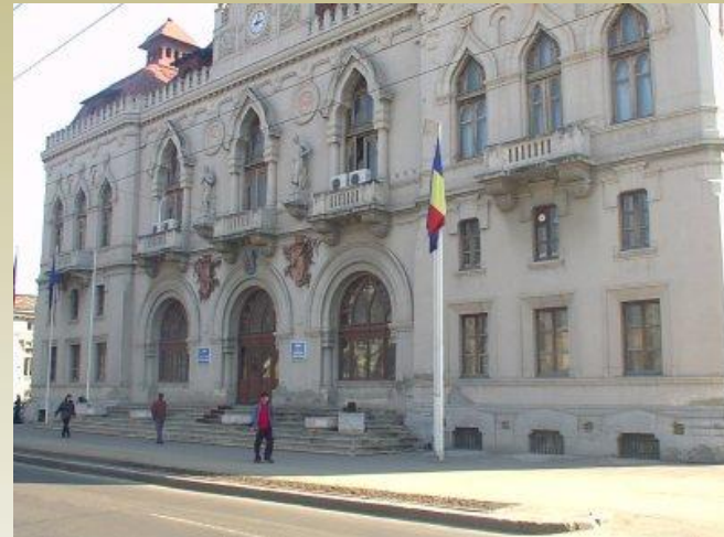
Prefecture of Galați