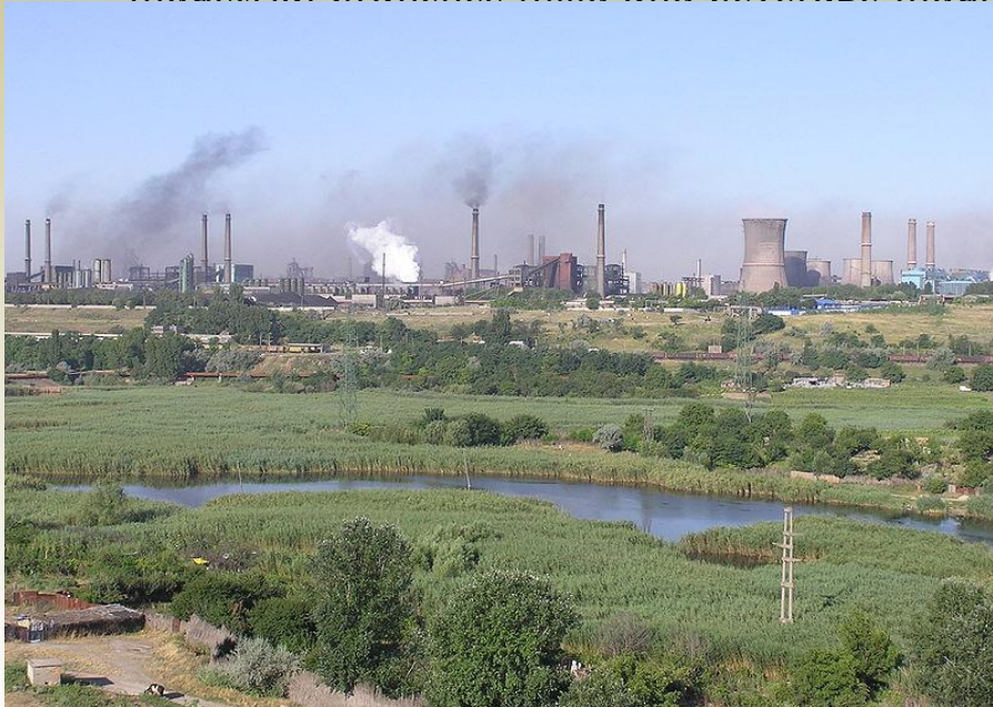
ArcelorMittal Steel Mill Galati

With over 100 years of history, the shipyard of Galati is the oldest in Romania. Other industrial branches (food-and beverage industry, textiles) are also very well represented in the city