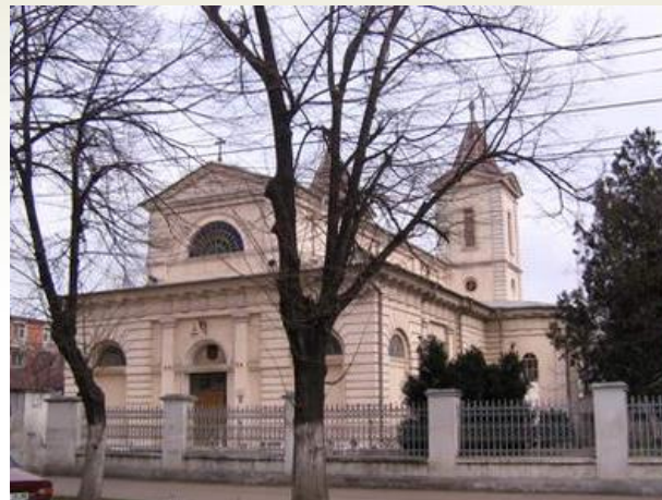
Roman Catholic Church