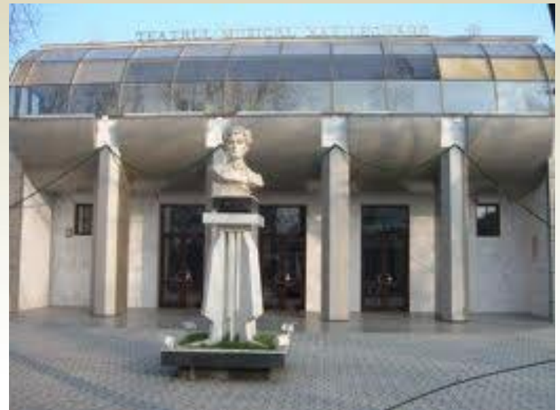
“Nae Leonard” Musical Theatre