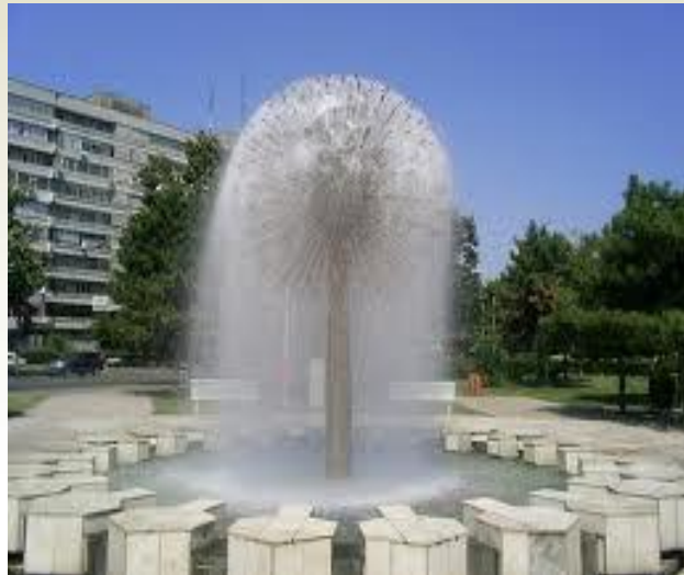
Păpădie (Dandelion) Fountain