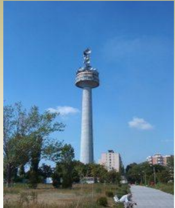
Galați TV Tower