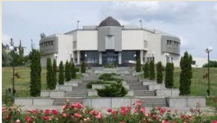
Natural Sciences Museum Complex