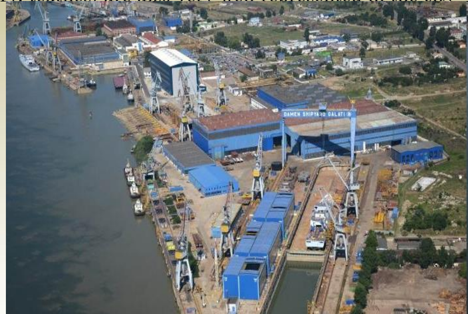
Damen Shipyards Galati