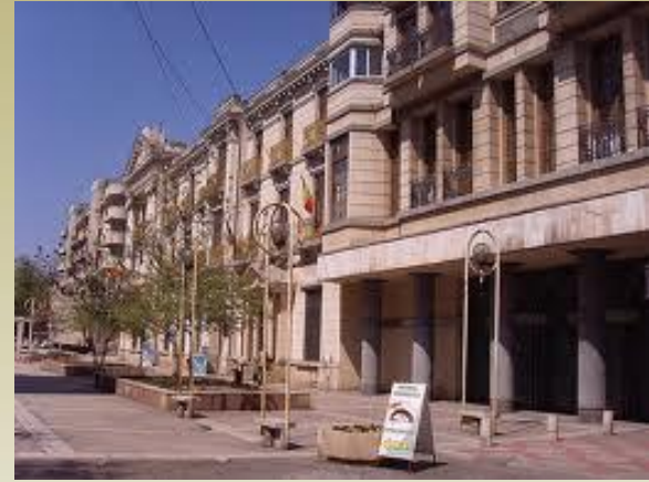
Galați History Museum