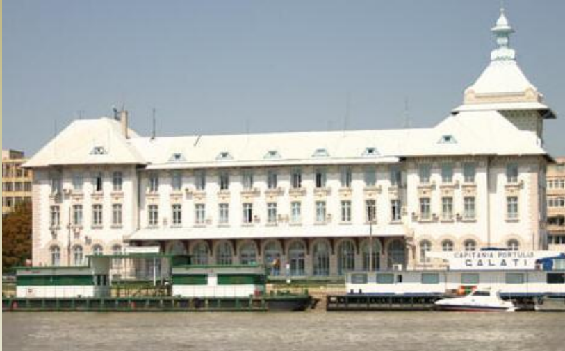
Palace of Navigation (River Station)